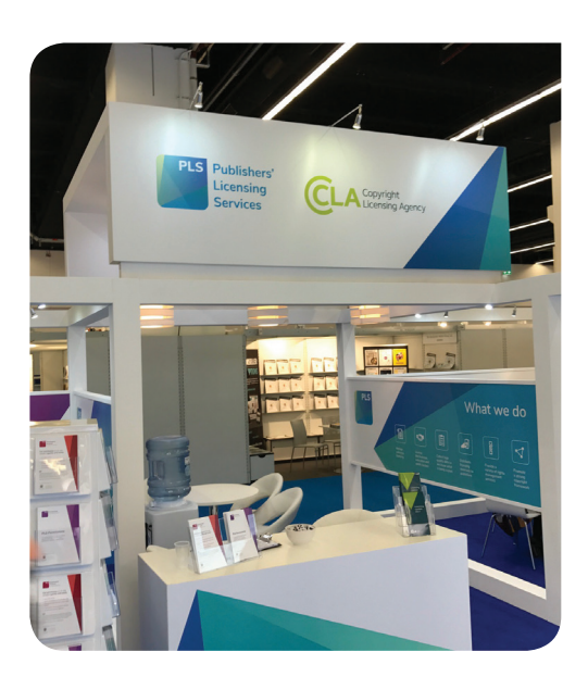
The PLS exhibition stand at the Frankfurt Book Fair, October 2017